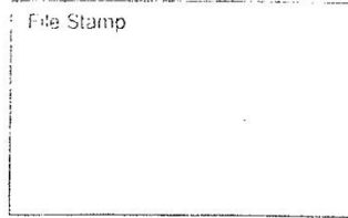
EXHIBIT 1-A Medication Capacity Appeal

SUPERIOR COURT OF CALIFORNIA, COUNTY OF TULARE